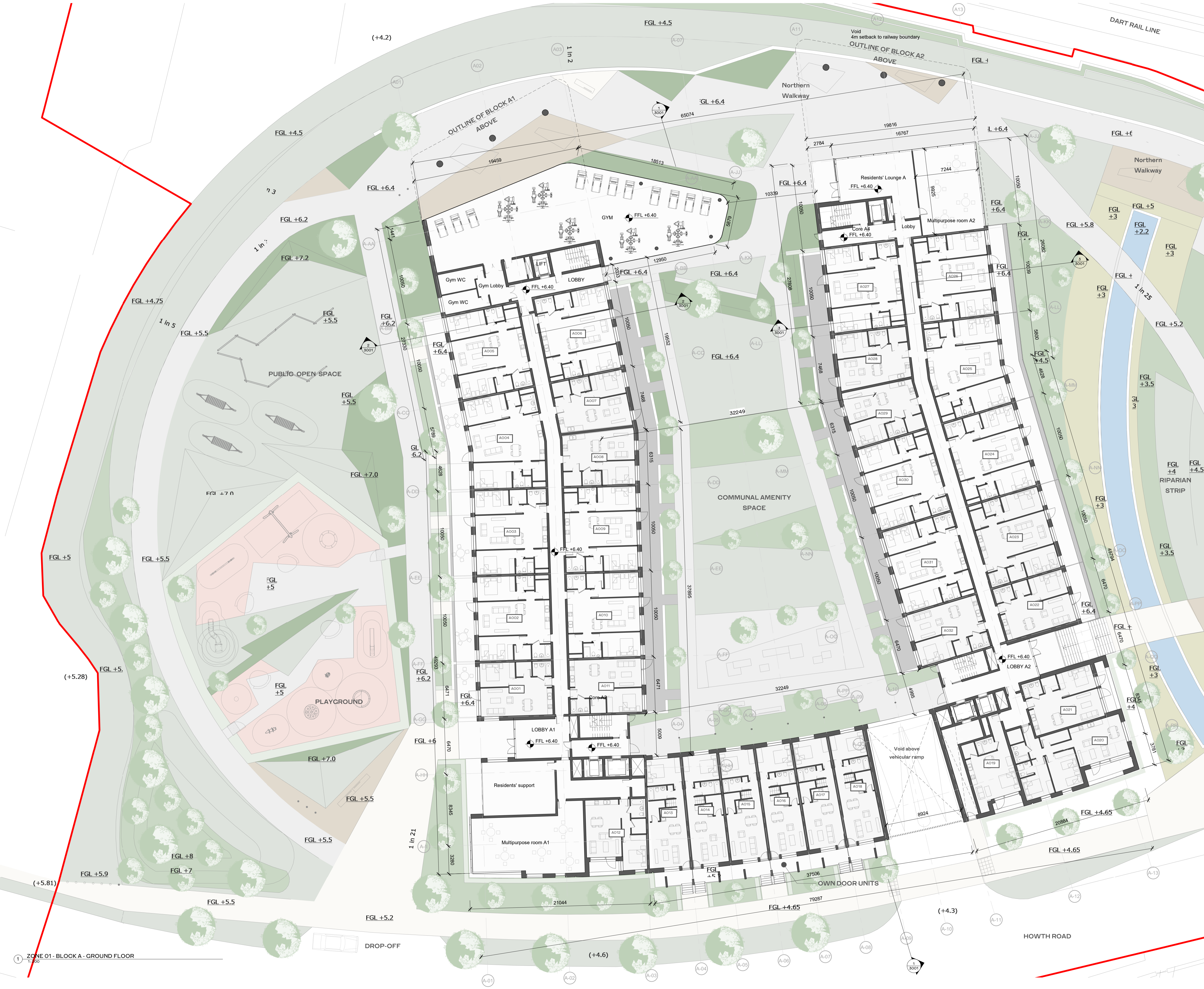
1 ZONE 01 - BLOCK A - GROUND FLOOR 1:500

Henry J Lyons Architecture + Interiors +353 1 888 3333 info@henryjlyons.com 53-54 Pearse Street Dublin D02 K466